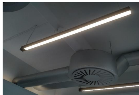
Example shown above with PIR infill

Efficiency in luminaire lumens per circuit watt: 97