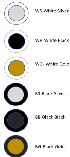
Atto and Nano Ring and reflector colour combinations

Efficiency in luminaire lumens per circuit watt: 70